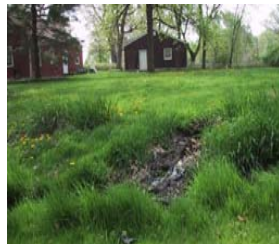
A failed septic system.

Failing septic systems must be addressed immediately. This information is intended to guide the responsible party toward a solution that is both effective and reasonable, and to define the responsibilities and services of the Lake County Health Department in addressing failing wastewater systems.